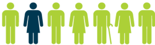
1 IN 7 seniors struggles with hunger

TOO MANY SENIORS ARE LEFT BEHIND, ALONE AND HUNGRY, STRUGGLING TO STAY INDEPENDENT AND HEALTHY.